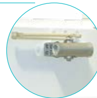
Sequential Door Closing System