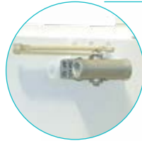
Sequential Door Closing System